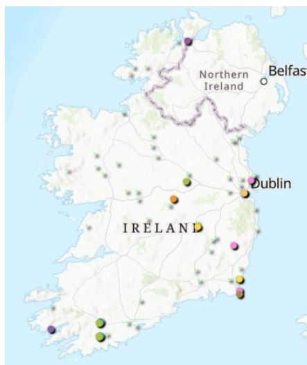
Figure 1: cases of HPAI detected in wild birds in Ireland in 2025 (as of 29/04/2025).